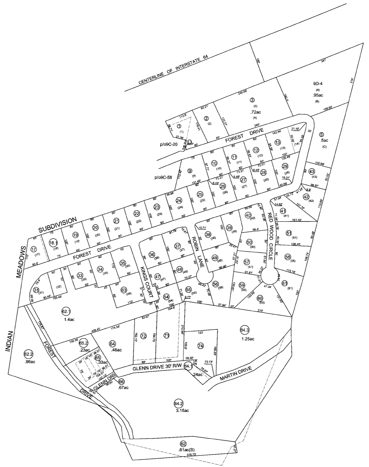
SHERWOOD ESTATES SUBDIVISION SECTION NO.1