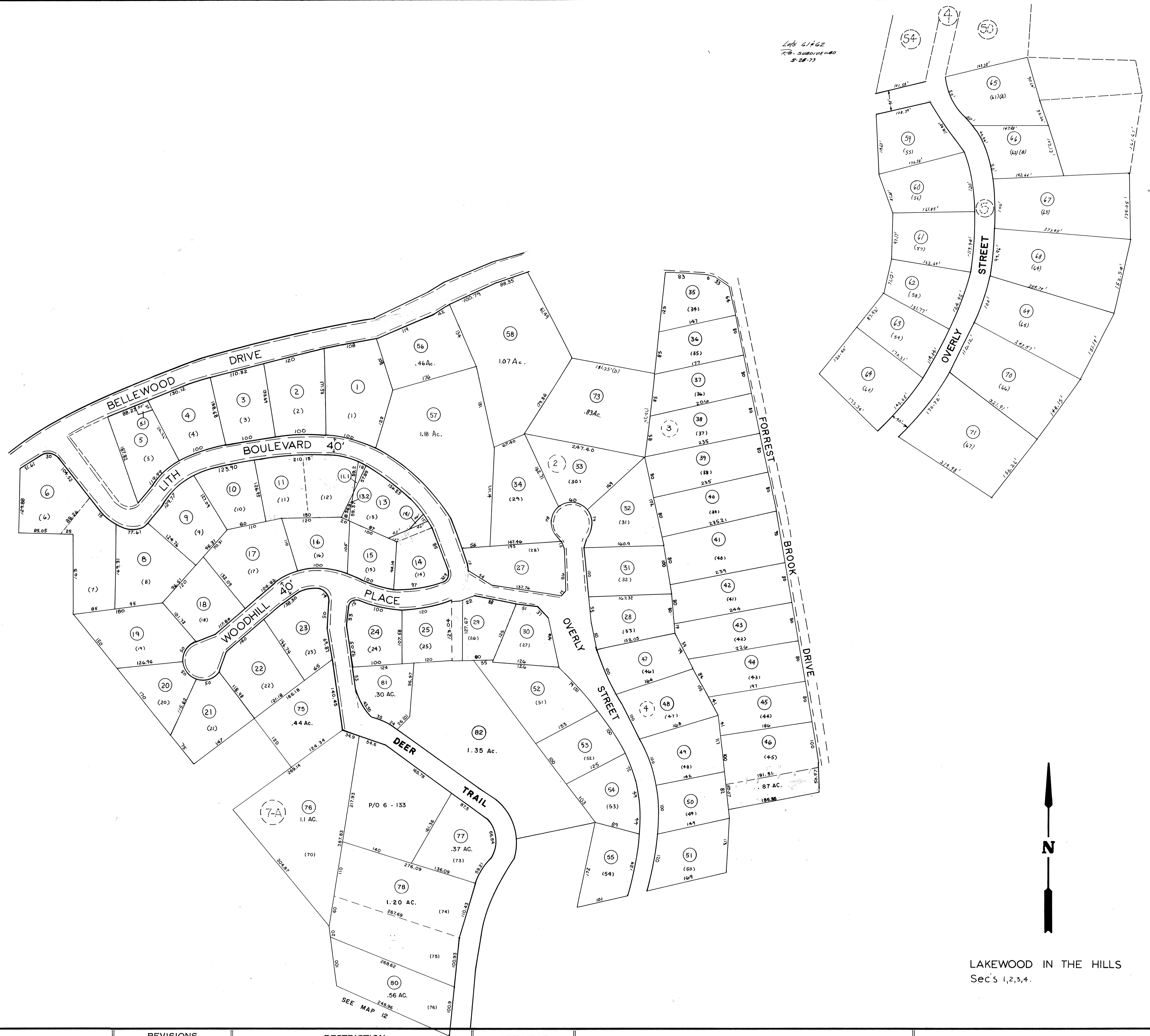
LAKEWOOD IN THE HILLS Sec's 1,2,3,4.

For Tax Purposes Only Prepared by LOCAL GOVERNMENT RELATIONS DIV. STATE TAX COMMISSIONER CHARLESTON, W.VA.