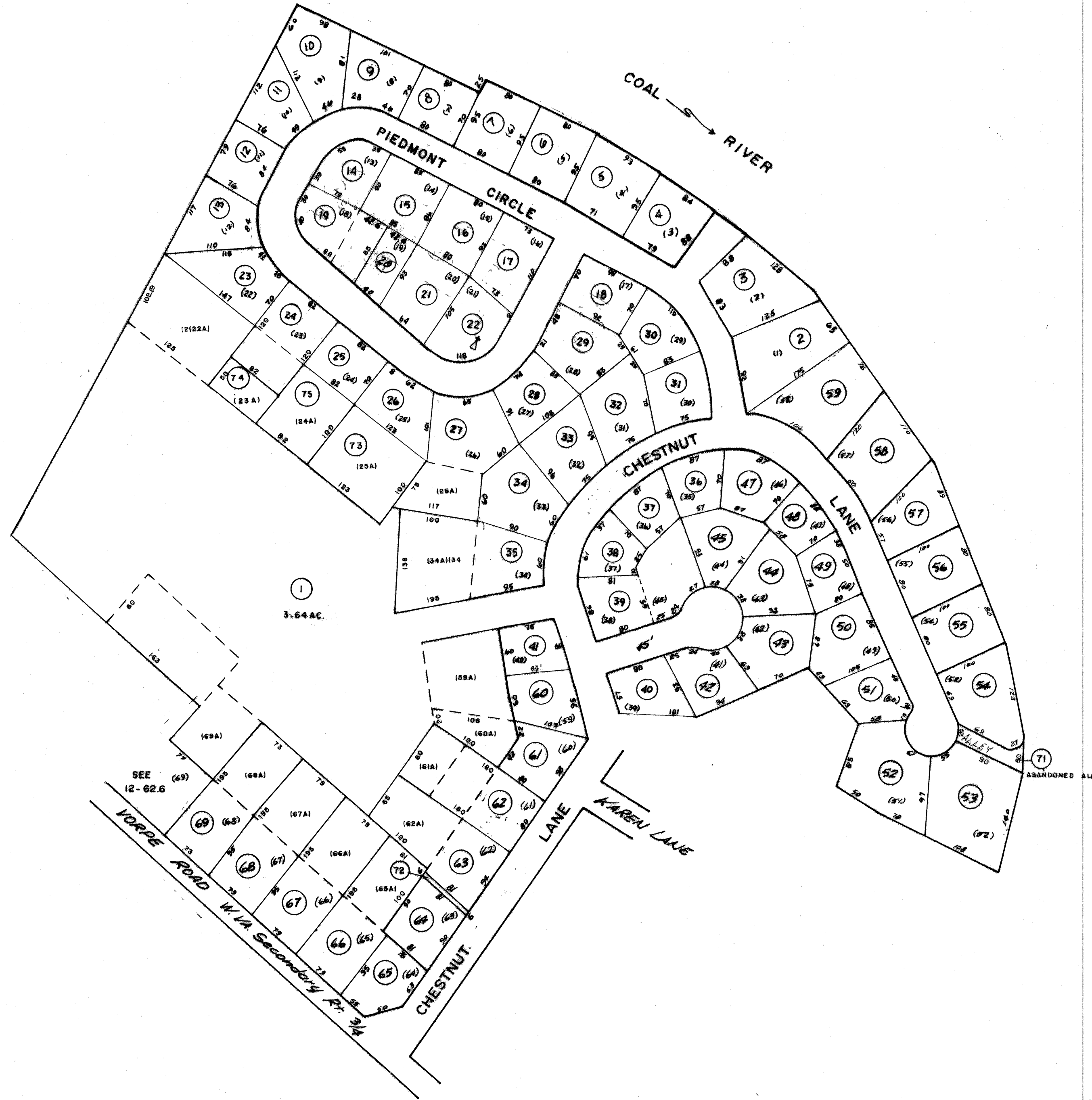
CHESTNUT POINT SUB-DIVISION