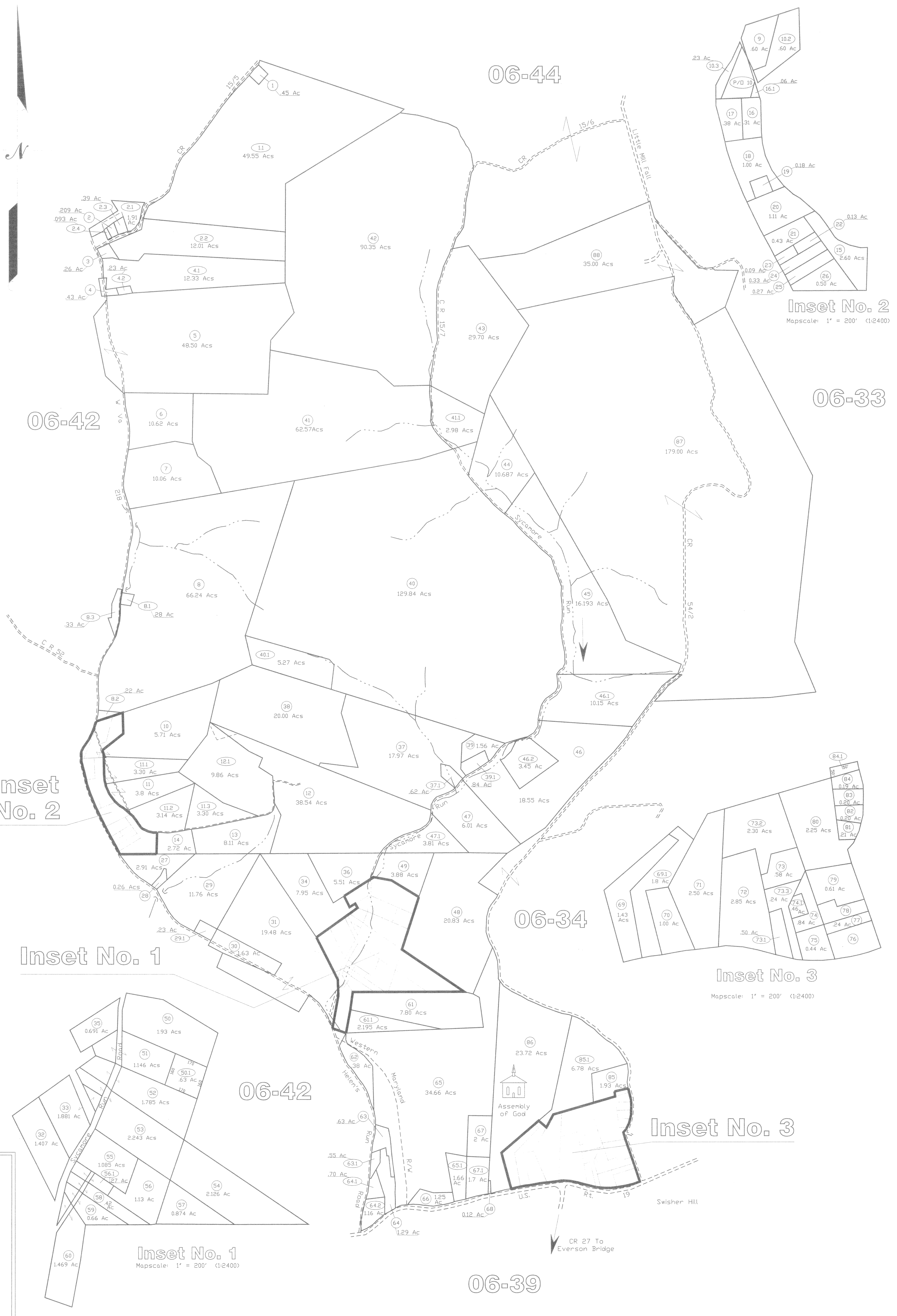
Inset No. 2 Mapscale: 1" = 200' (1:2400)