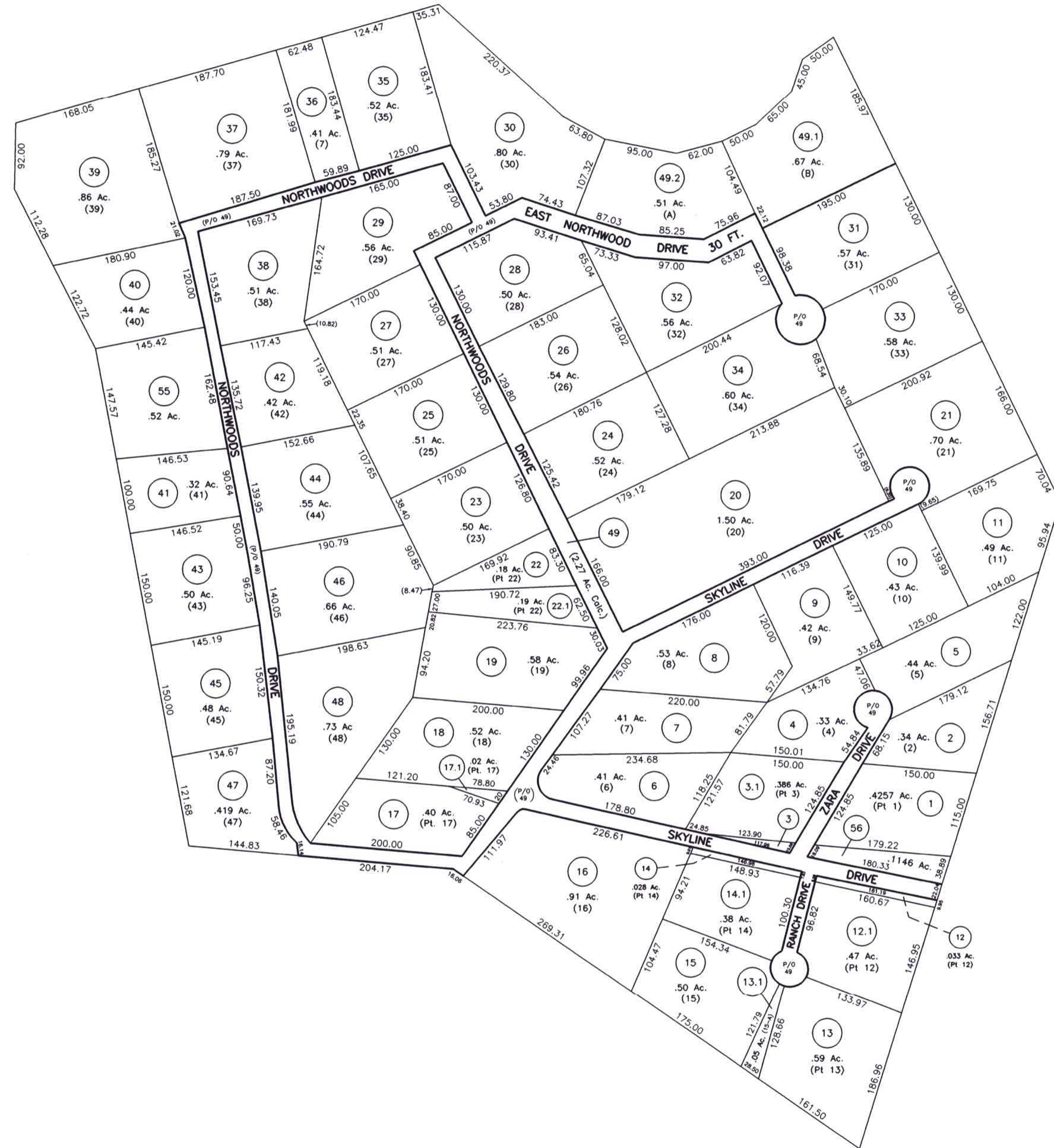
SKYLINE ESTATES (REVISED) PARCELS (1-49 & 55) INSET 1