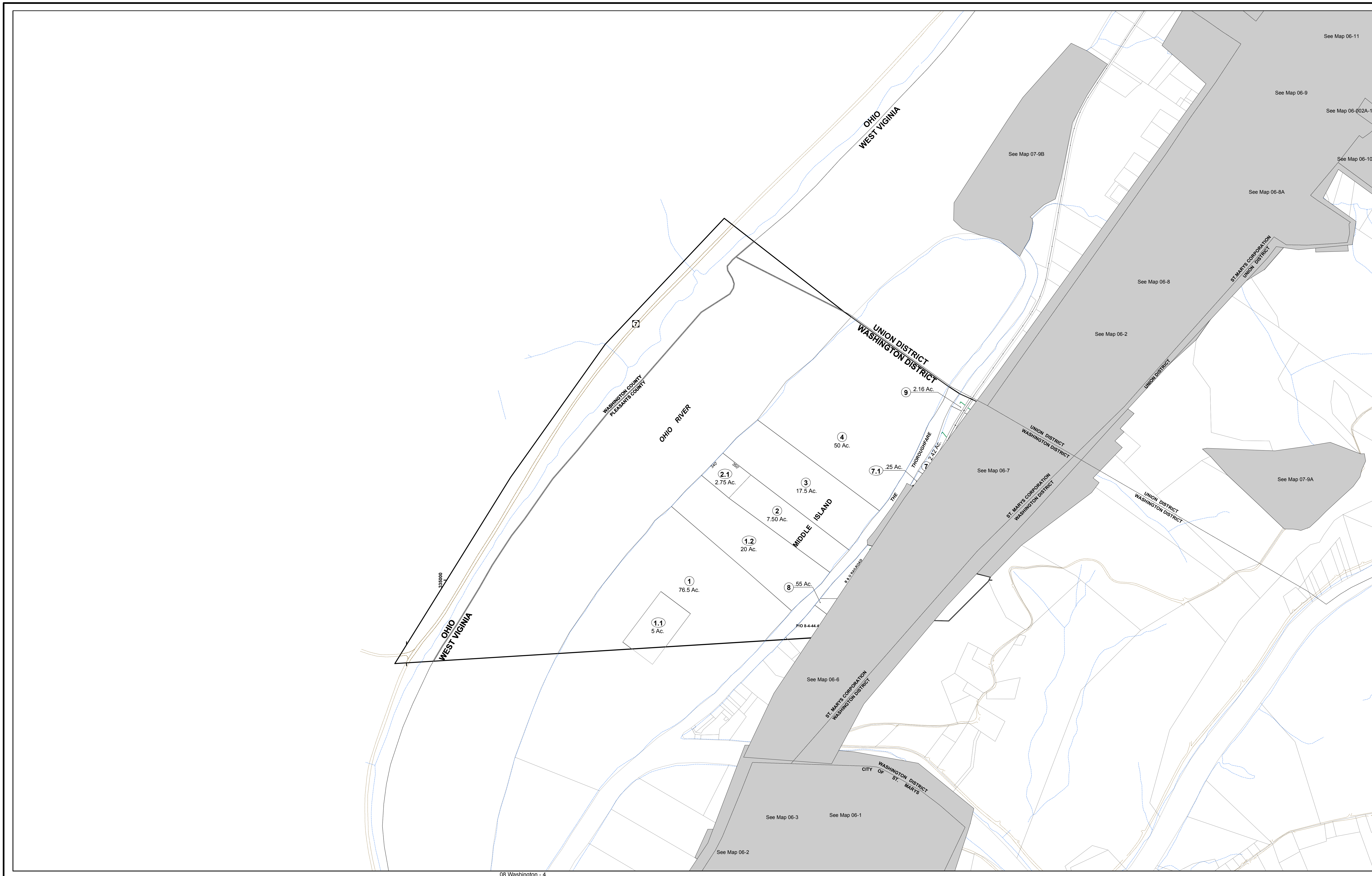
08 Washington - 4