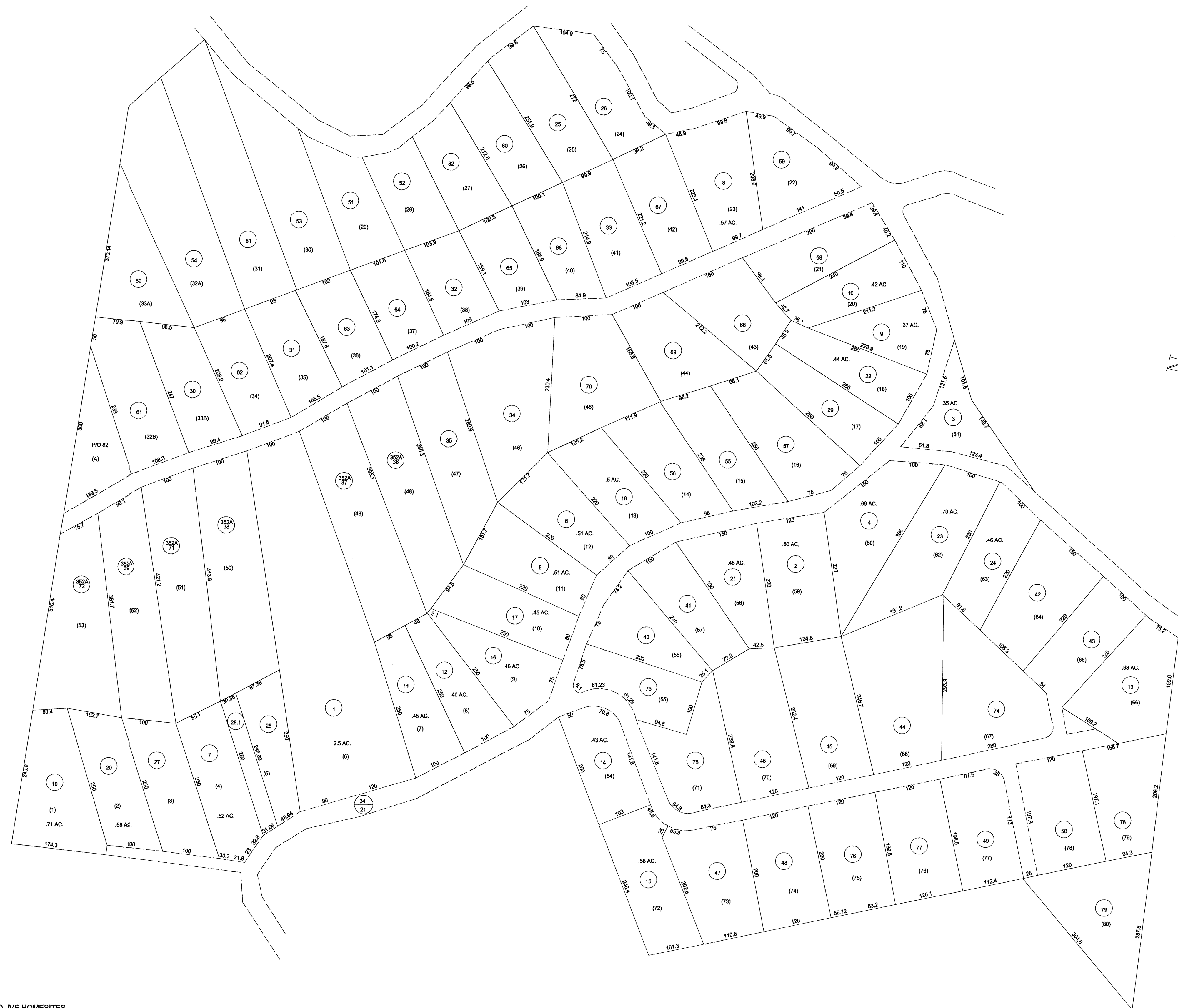
MT. OLIVE HOMESITES