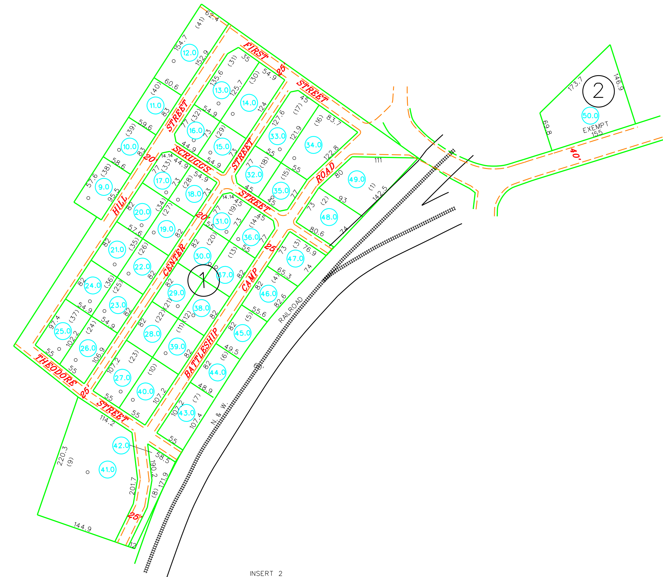
INSERT 2 SCALE: 1"=100'