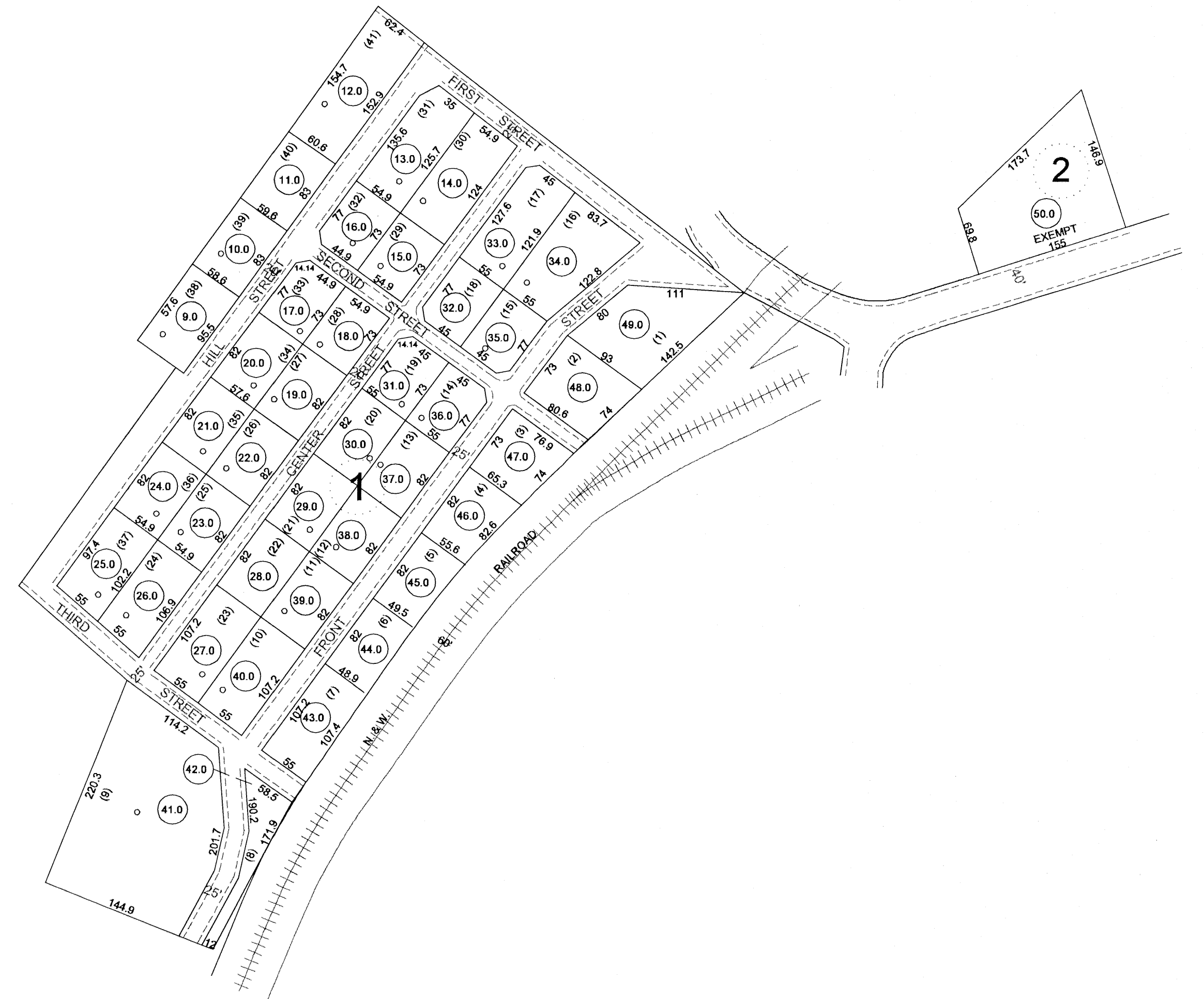
INSERT 2 SCALE: 1"=100'