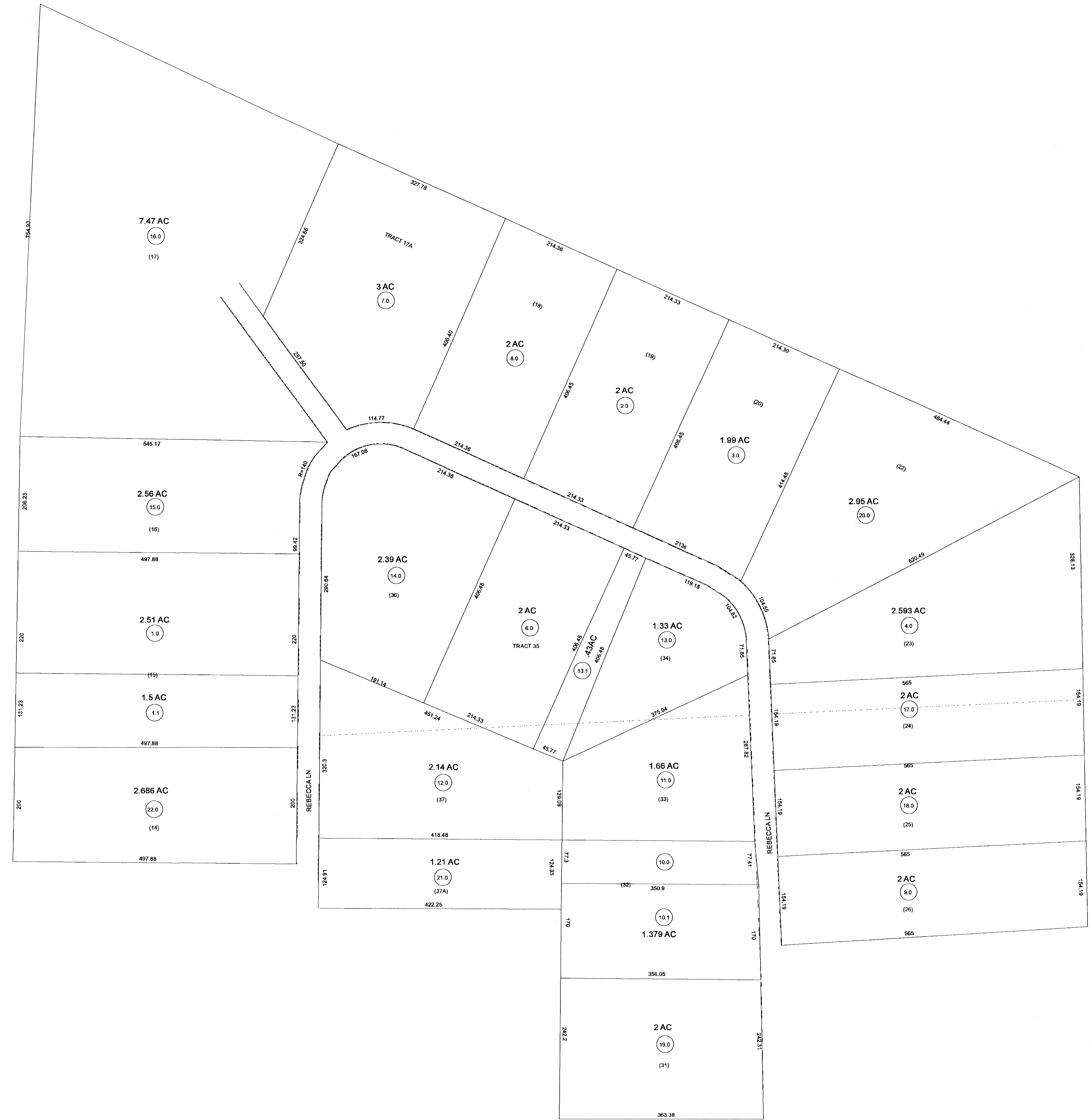
PHASE No. 2 GRANDVIEW ESTATES

For Tax Purposes Only Prepared by RALEIGH COUNTY ASSESSOR'S OFFICE DREMA B. EVANS, ASSESSOR BECKLEY, WV