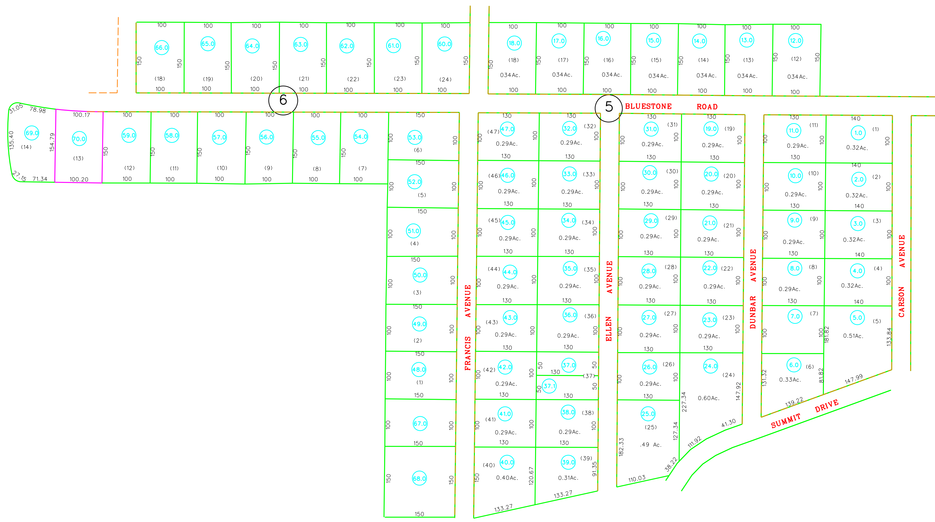
MORGAN HILLS SUBDIVISION NO. 1 SECTION 5