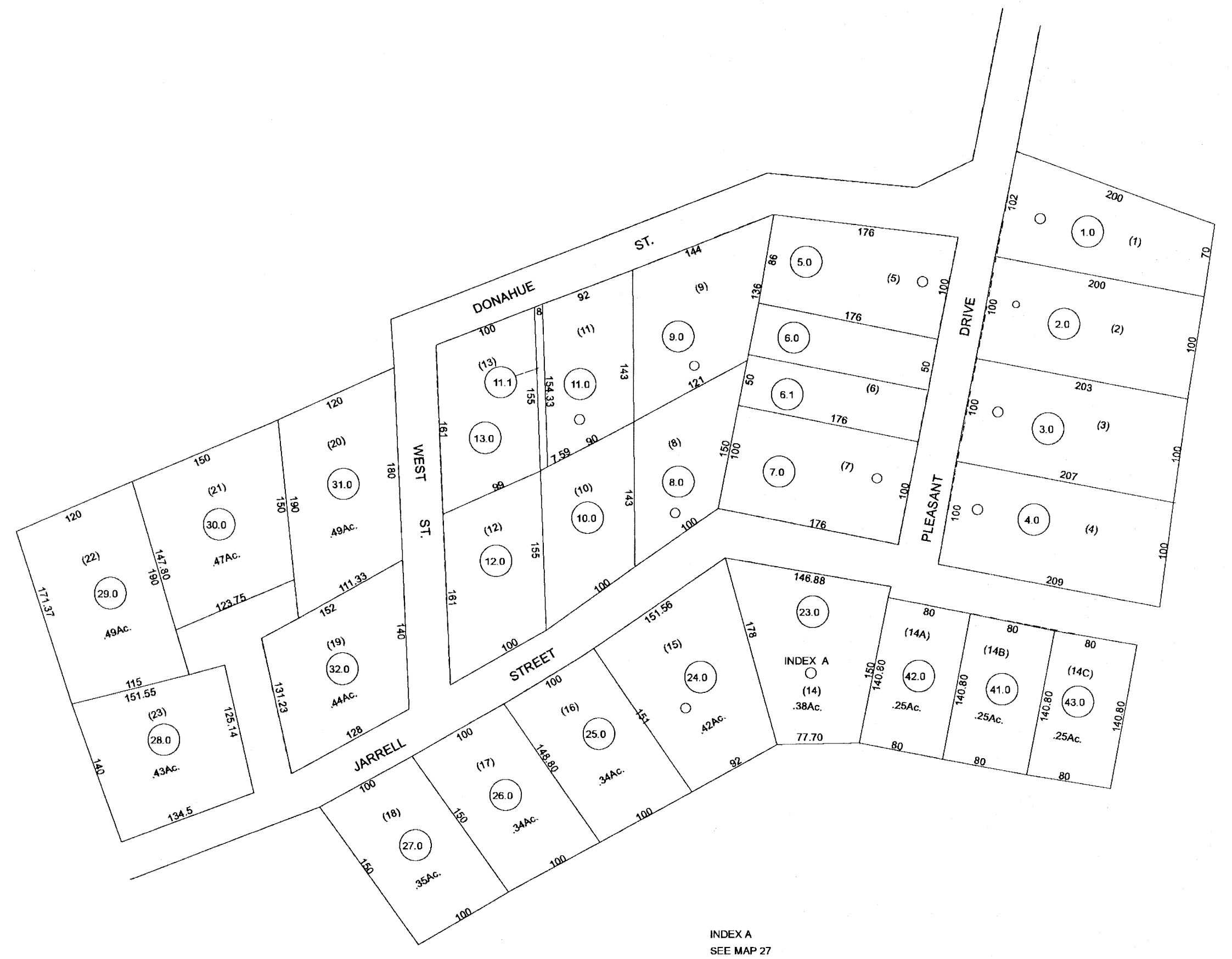
INDEX A SEE MAP 27 PLEASANT VALLEY SUB-DIVISION