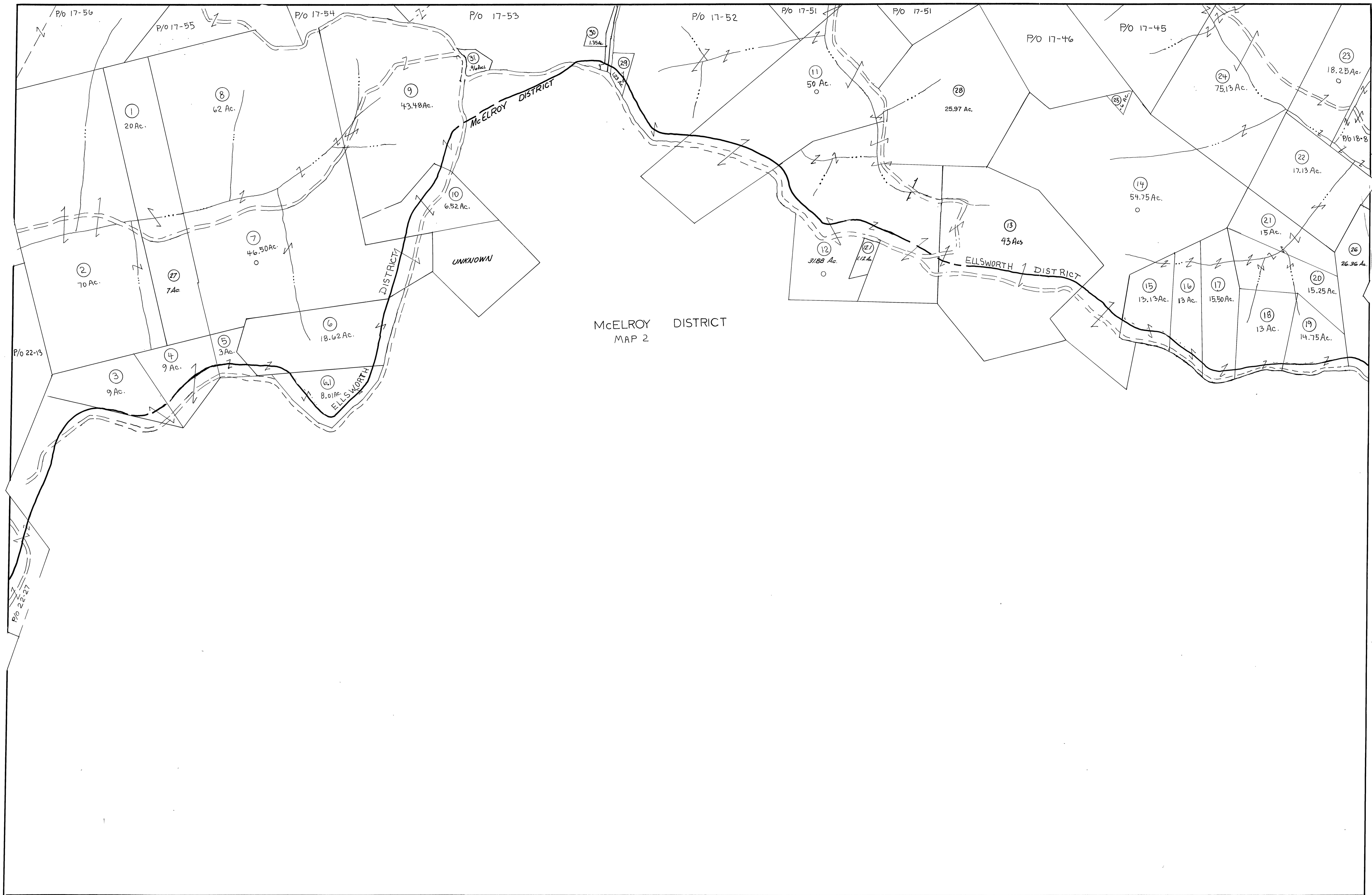
McELROY DISTRICT MAP 2