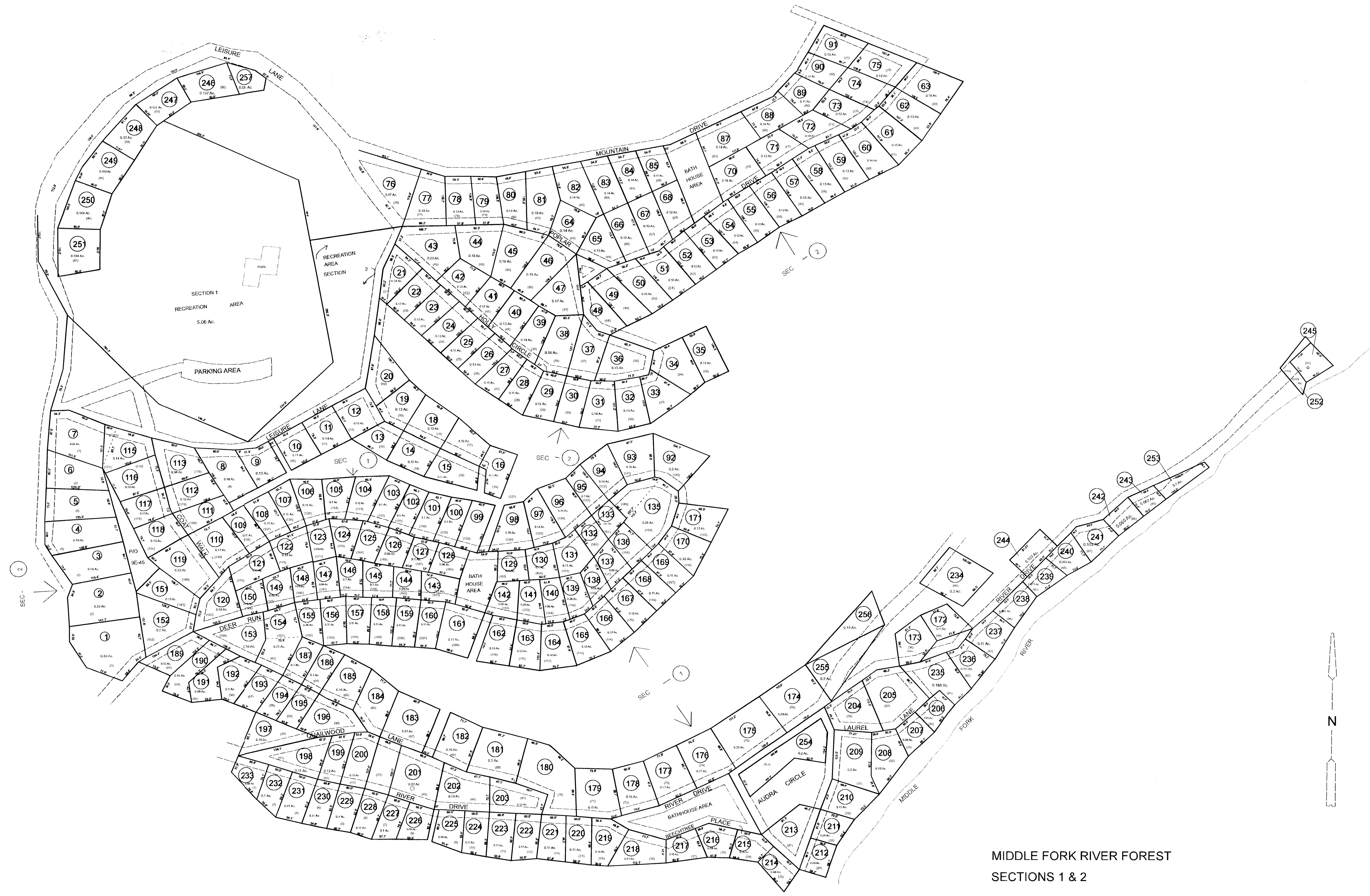
MIDDLE FORK RIVER FOREST SECTIONS 1 & 2