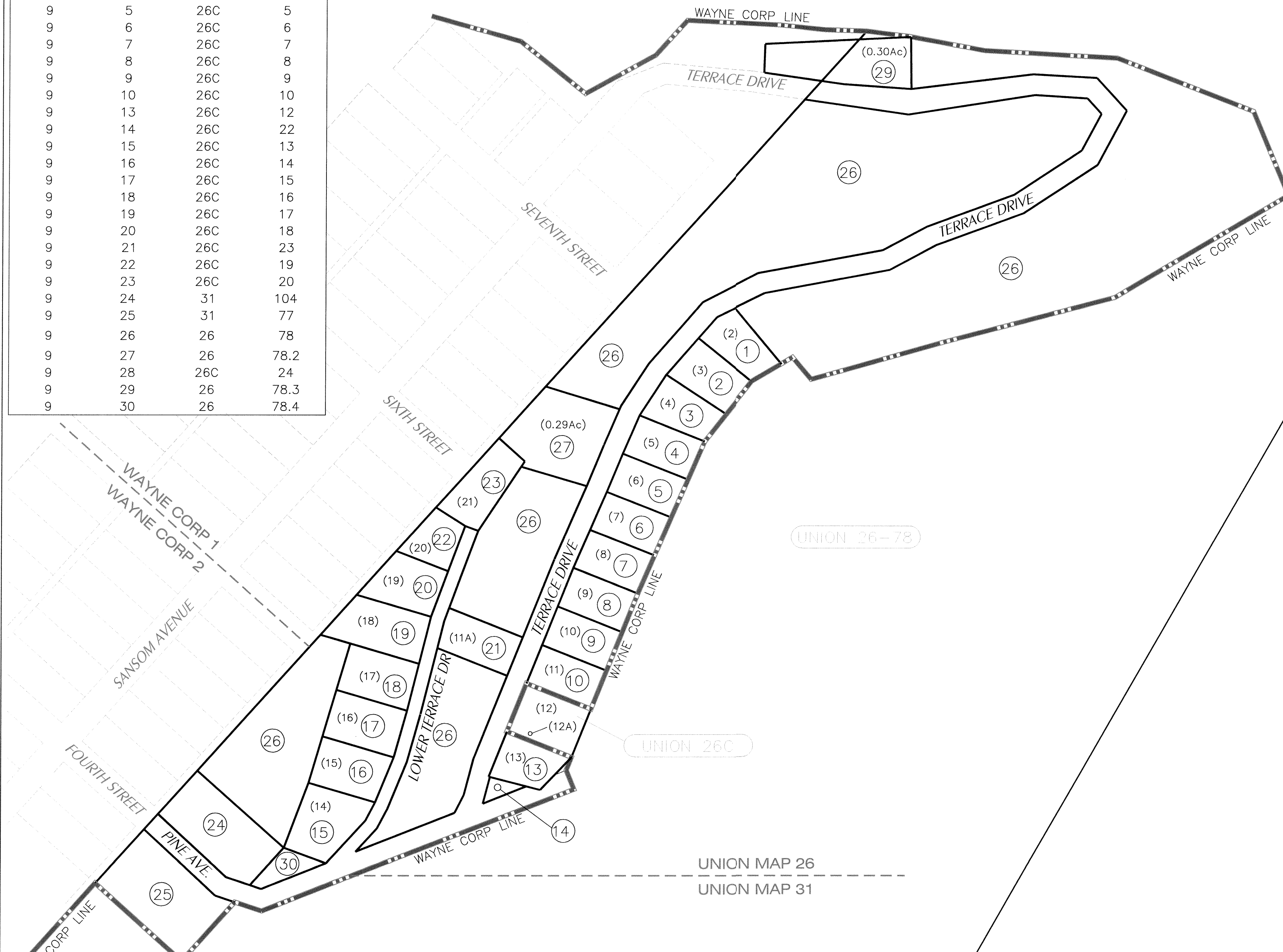
CEDAR CREST SUBDIVISION MB 7 PGS 41 & 71