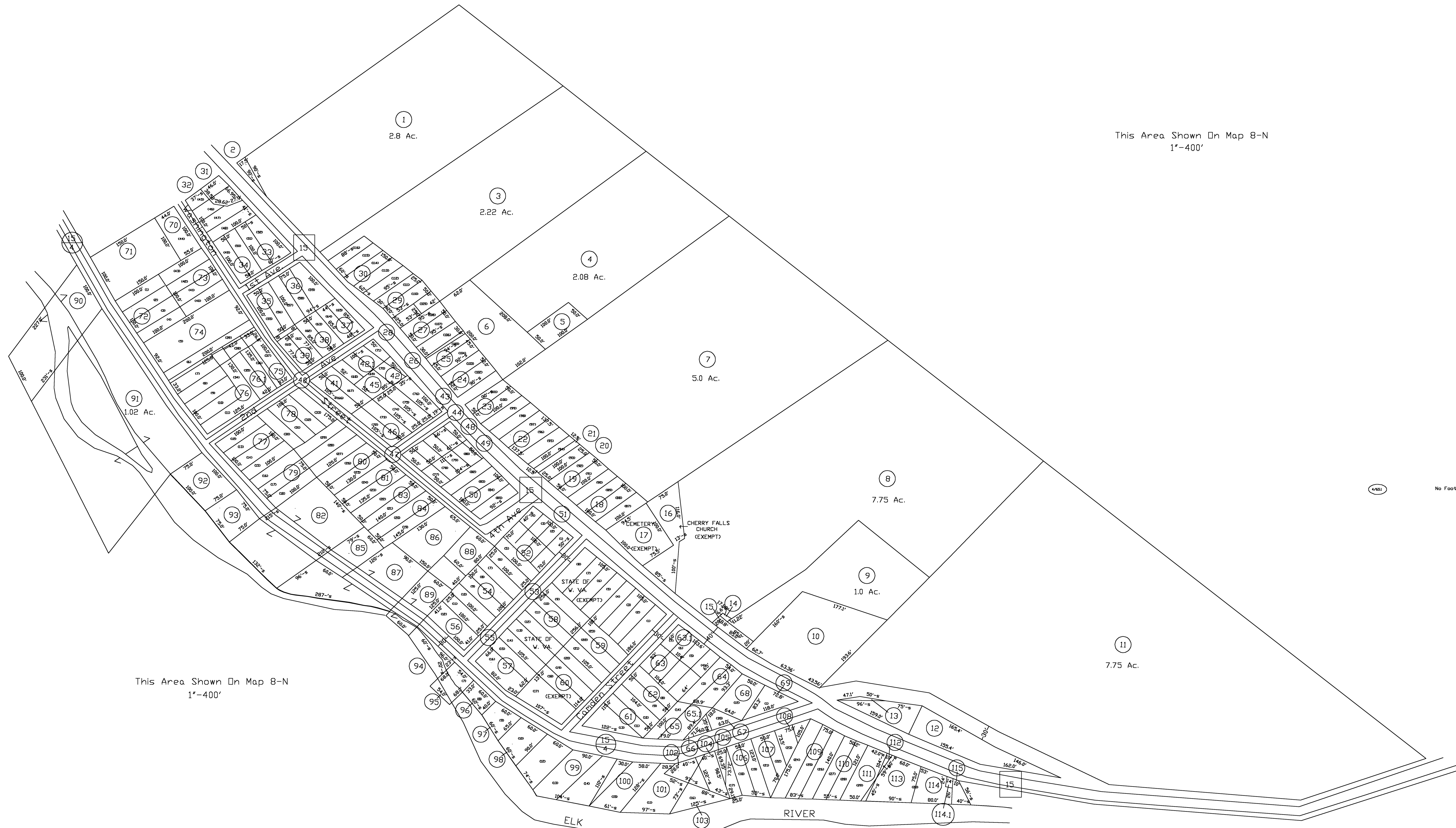
YORK-JOHNSON AND HOOVER ADDITIONS SCALE=1"=100'